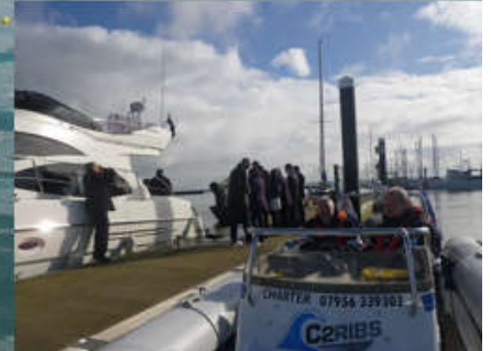
BOAT LEAVING LYMINGTON AND MAKING ITS WAY PAST THE NEEDLES ON ROUTE TO THE BURIAL AREA