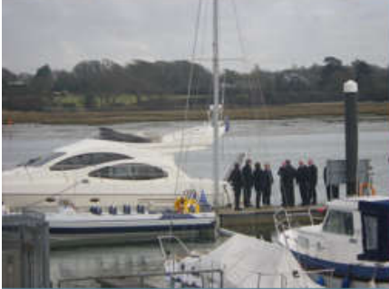
ARRIVAL OF THE COFFIN AND THE FUNERAL PARTY